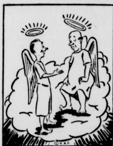
"Sure scared hell out of that train engineer."

If you can't stop, wave as you go by! ADKINS 66 OIL & GAS COMPANY "We Give S&H Green Stamps!" 302 E. Commerce—Ph. 684-4541