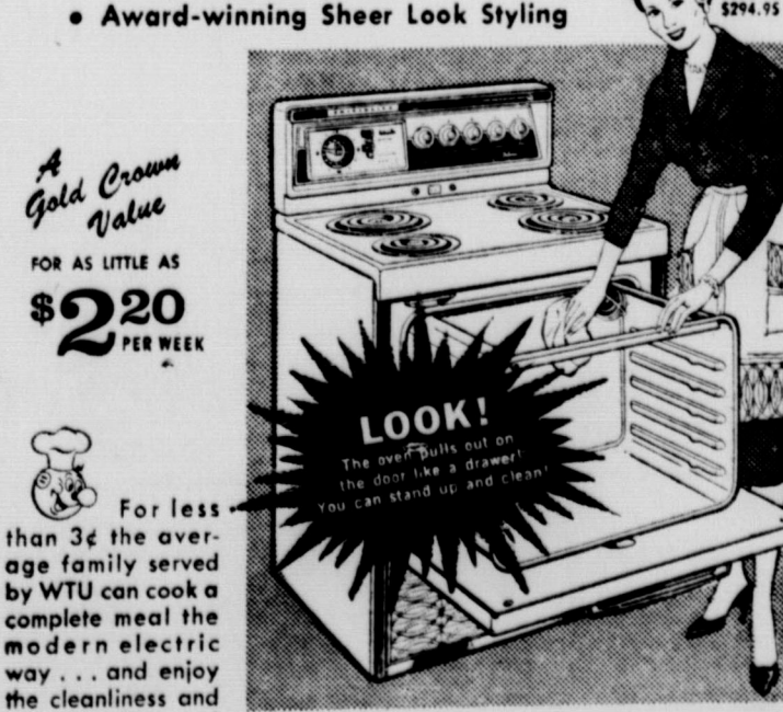
West Texas Utilities Company