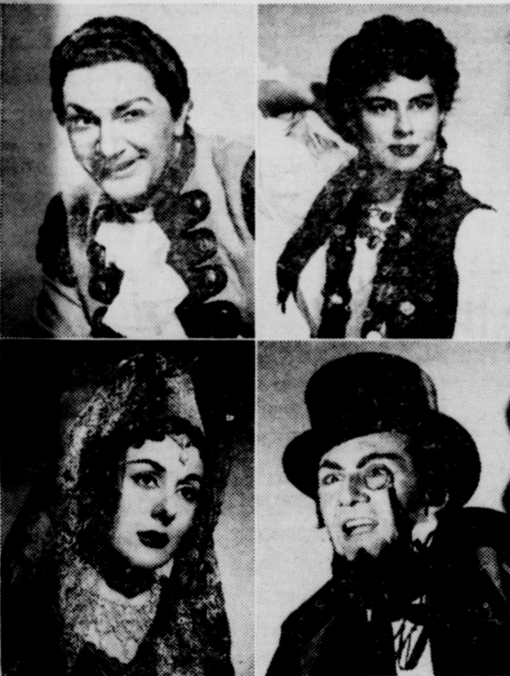
Above, Giorgio Tozzi and Lisa Della Casa. Below, Antonietta Stella and Cesare Siepe

The Metropolitan Opera, the world's leading musical company, will be imported to Dallas by civic leaders for four operas May 13 to 16 in State Fair Music Hall. Four of the celebrated stars are shown above. The season will present: Friday evening, May 13, "The Marriage of Figaro," with George London, Elisabeth Soderstrom and Giorgio Tozzi, followed by the opera ball honoring the stars: Saturday matinee, May 14, "The Gypsy Baron," with Lisa Della Casa, Laurel Hurley and Broadway acting star Walter Slezak; Saturday evening, May 14, "Faust," with Cosare Siepe and Anna Maffei, and Sunday matinee, May 15, "Il Trovatore," with Antonietta Stella, Jean Madeira and Robert Merrill.