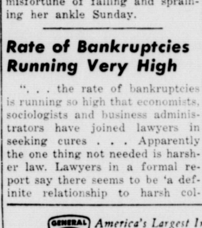
America's Largest Independent Telephone System