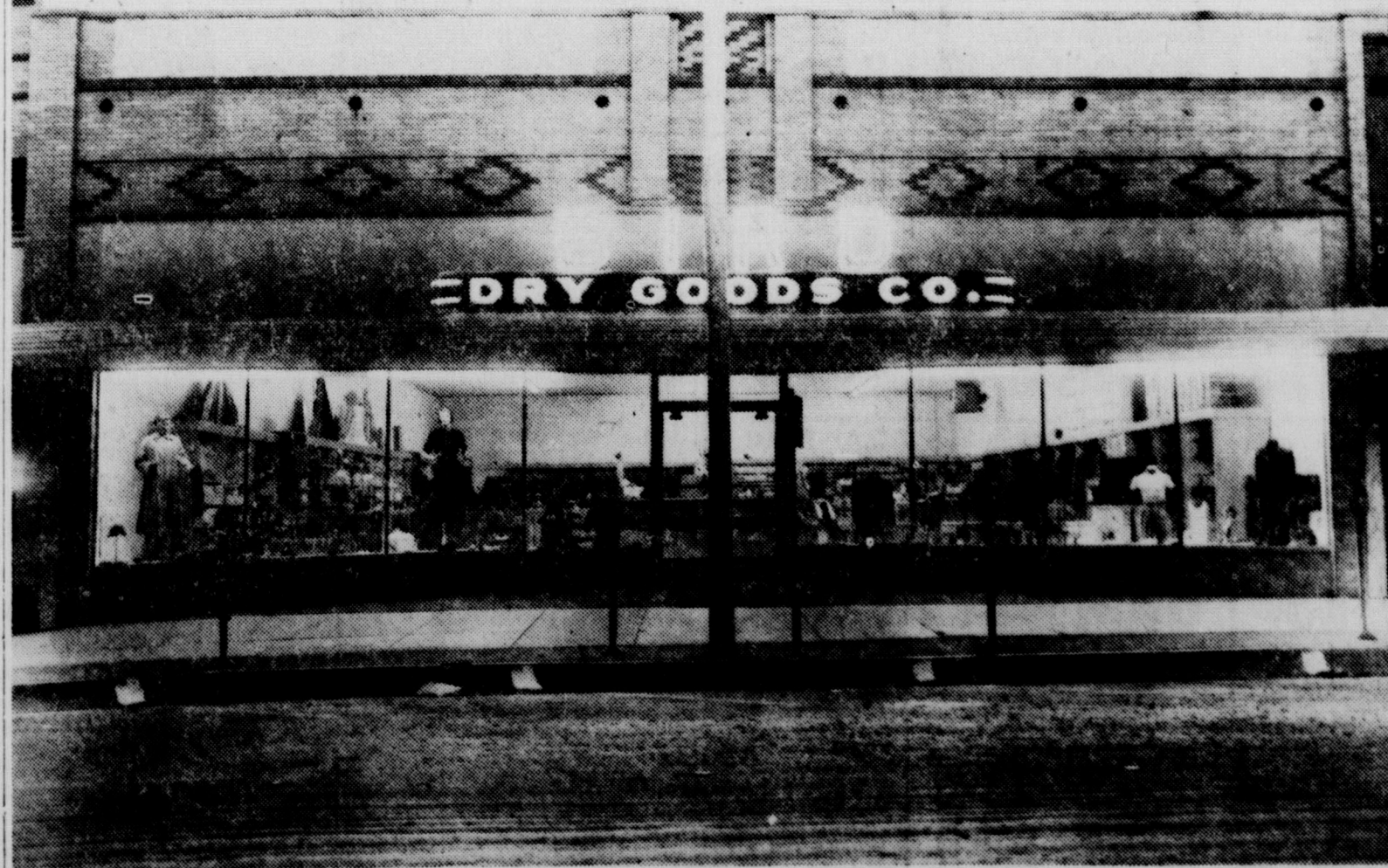
NEW HOME OF BIRD DRY GOODS CO.—Pictured above is the completely new and modern home of the Bird Dry Goods Company. The new business is located on the west side of the square in the same location as the Lanier building, which was destroyed by fire last December. Formal opening of this new business will be held tomorrow morning.