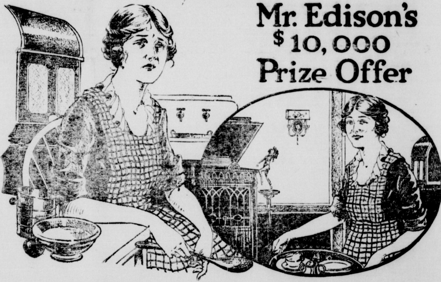
Too tired to get dinner