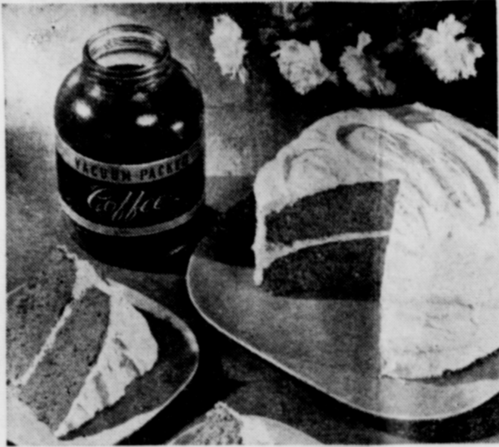
Both batter and frosting are made with coffee in new cake recipe.

Coffee, which continues to become more popular as America's favorite hot or iced drink at all hours of the day, is one of the finest flavorings for desserts.