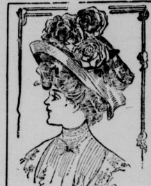
REGINA HATS F. F. & Co. K.C.Mo.

A share of your grocery trade solicited, delivered at your door.