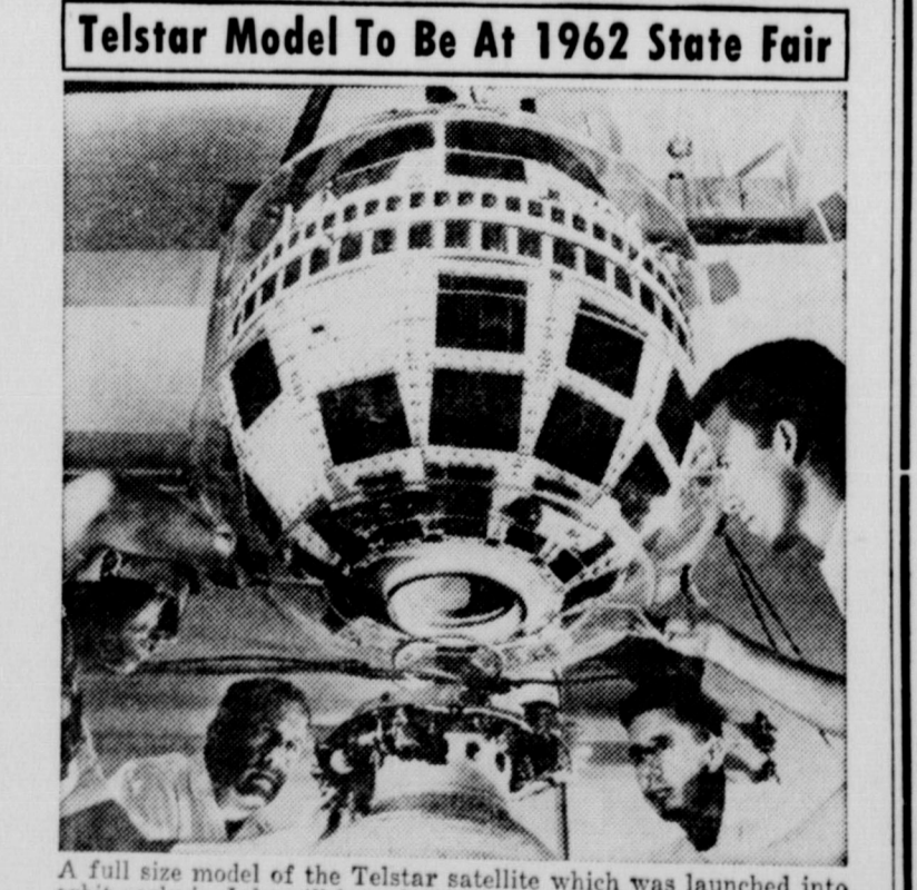
A full size model of the Telstar satellite which was launched into orbit early in July will be a feature of the new Telephone Exhibit at the 1962 State Fair of Texas, Oct. 6-21, in Dallas. The Telstar, shown here undergoing tests, is 54 inches in diameter and has 72 flat faces or facets. The Telephone Exhibit, to be completely redesigned for the 1962 Fair, will occupy a prime exhibit area in the World Exhibits Building.

place of entertainment. "Naturally," Campbell cautioned, "the amount of the expenditure must be ordinary and necessary. If the sum is sizeable, be sure to keep a copy of the bill. It's necessary for us to know whether the entertainment was paid by out-of-pocket cash, credit card, check, or charged to the employer."