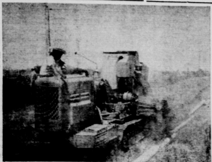
DIGGING DITCH —Shown above is the digger which was busy when this picture was made last Thursday, digging a ditch for the pipe line from the wells north of Thalia into town. The ditch has been completed now and work continues on the new water system for Thalia.