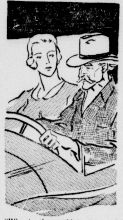
Why in the world is the ranch called the Dead Lantern

the mountain tops belongs to the Dead Lantern?"