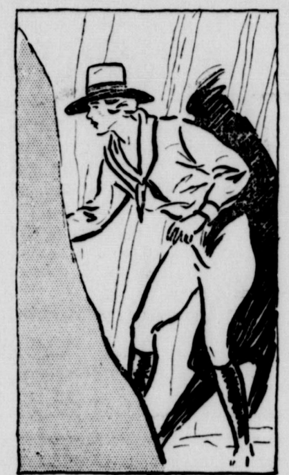
She looked into every depression, behind every boulder.

Slowly, Ruth moved away from the sounds of the bird, to go toward it. She soon discovered that if she went a few feet to right or left she could not hear the bird at all, al-