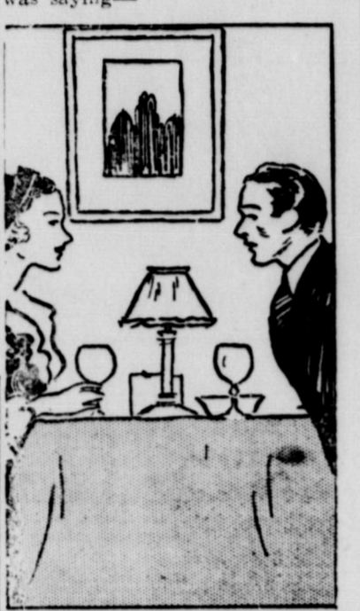
It wasn't such a gay luncheon, after all.

table from her new husband—nervously sipping a tomato juice cocktail and trying not to quake both inwardly and outwardly—Ellen endeavored to tell herself that it was really her name, now.