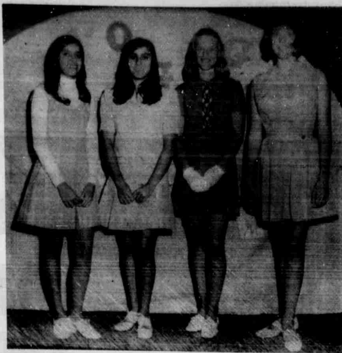
DRESS REVUE WINNERS