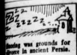
...ing was grounds for ... in ancient Persia.

The tryouts for the talent show will be held Monday. This is one of the money-making events to send the choir to Amarillo. Also, at the talent show, the