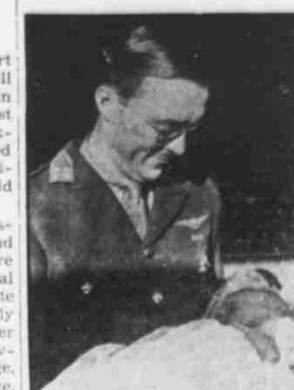
OTTAWA, CANADA — Prince Bernhard proudly poses with his third daughter, Princess Margriet Francisca, born to Crown Princess Juliana of the Netherlands at the Civic Hospital in Ottawa, the first