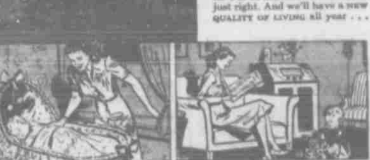
"No more destrat There'll be live air circulating all the time! Windows will stay closed. The bouse'll be quieter. we Baloop better, because atrest noises will stay metalds with Bervel Ail-Your Gas Air Conditioning. Mora