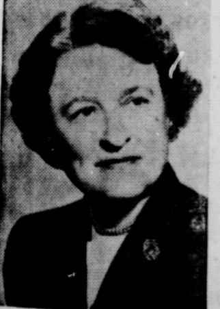
Judge Sarah T. Hughes, for 23 years a Texas District Judge, announced her candidacy April 20 for the State Supreme Court.