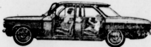
CORVAIR MONZA 4-DOOR SEDAN From snappy interiors to sure-footed seat, this one's got the gift of making sport of most any trip.