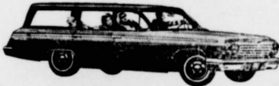
NEW BEL AIR 4-DOOR STATION WAGON Jet-smoothie that rides just right, loaded or light—with 97.5-cu.-ft. cargo cave and Full Coil suspension.

You won't find a vacation-brightening variety like this anywhere else. And now that spring has sprung, the buys are just as tempting as the weather. Your choice of 11 new-size Chevy II models. Fourteen spacious, spirited Jet-smooth Chevrolets. And a nifty, nimble crew of rear-engine Corvairs. Three complete lines of cars—and we mean complete—to cover just about any kind of going you could have in mind. And all under one roof, too! You just won't find better pickings in size, sizzle and savings anywhere under the sun. And you couldn't pick a better time than now—during your Chevrolet dealer's Fun and Sun Days.