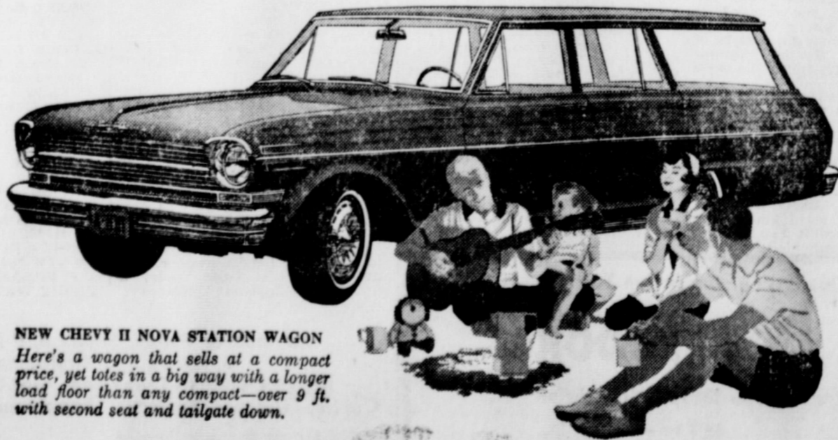
NEW CHEVY II NOVA STATION WAGON Here's a wagon that sells at a compact price, yet totes in a big way with a longer load floor than any compact—over 9 ft. with second seat and tailgate down.

See the new Chevrolet, Chevy II and Corvair at your Chevrolet dealer's One-Stop Shopping Center