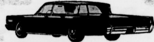
MERCURY MONTEREY 4-DOOR BREEZEWAY

got rave reviews for its new roofline, increased power and overall luxury! A real winner... and a real buy!