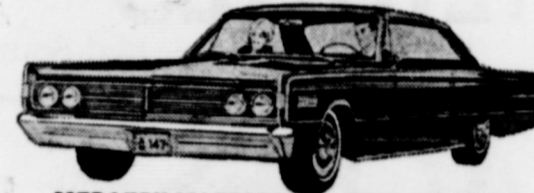
MERCURY MONTCLAIR 2-DOOR HARDTOP

We're trading high and coming on strong. Choose from 13 red hot Comet models for '66. It's the savings! Sale of the year! Come in today!