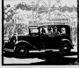
The Coach, $565, f. o. b. Flint factory

Yet, despite these fine car advantages, the Chevrolet Six is unusually economical. Its gas, oil,