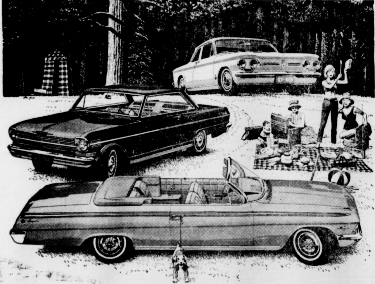
Top right—Corvair Monza Club Coupe

YOU'LL FIND JUST THE CAR AT JUST THE PRICE AT YOUR CHEVROLET DEALER'S ONE-STOP SHOPPING CENTER!