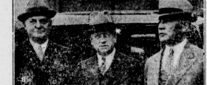
The head man of the petroleum industry, Secretary of Interior Harold Ickes, oil code administrator, came to Texas last week to attend the annual national A. P. I. convention in Dallas.