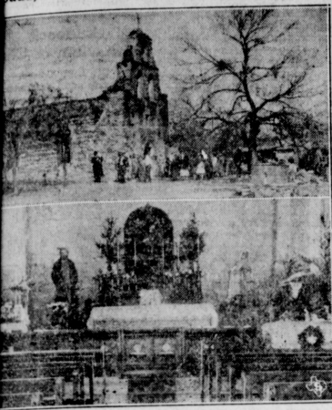
—Think—Talk—Write—Texas Centennial in 1936