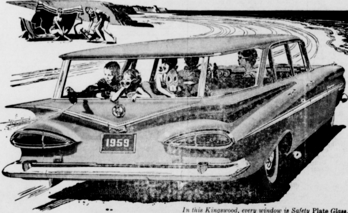
In this Kingswood, every window is Safety Plate Glass.

TOP TV—The Dinah Shore Chevy Show—Sunday—NBC-TV and the Pat Boone Chevy Showroom—weekly on ABC-TV.