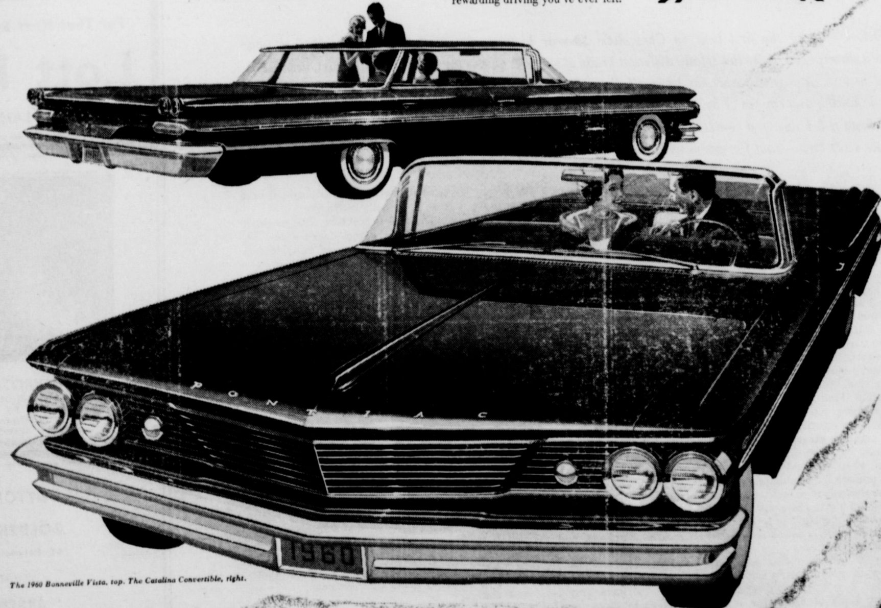
The 1960 Bonneville Vista, top. The Catalina Convertible, right.

PONTIAC THE ONLY CAR WITH WIDE-TRACK WHEELS ON DISPLAY TOMORROW AT ALL PONTIAC DEALERS