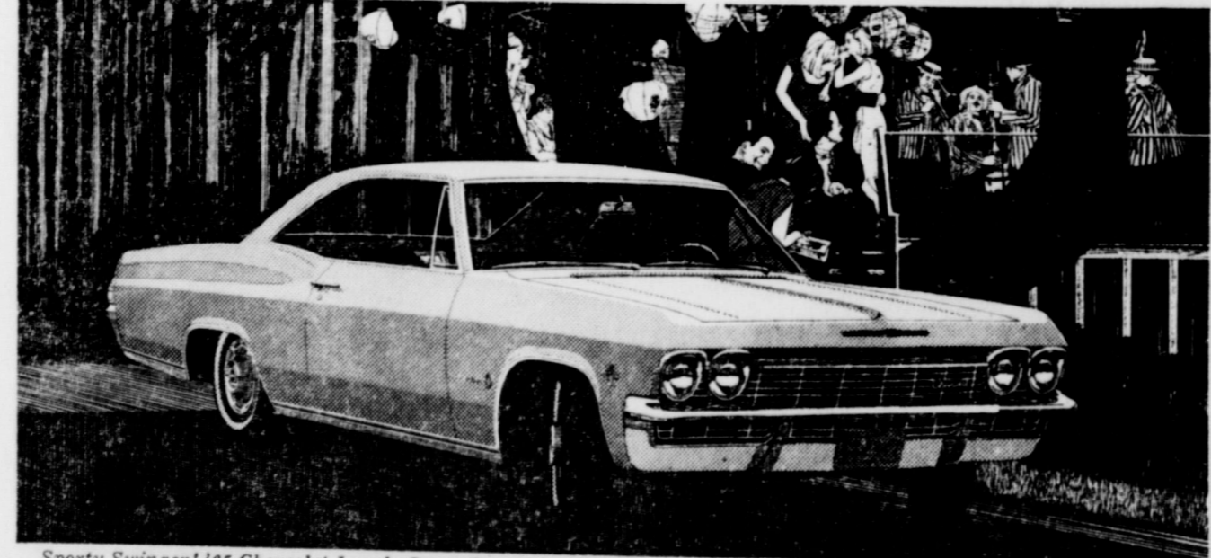
Sporty Swinger! '65 Chevrolet Impala Sport Coupe

Luxurious new look Luxurious new room Luxurious new ride (discover the difference)