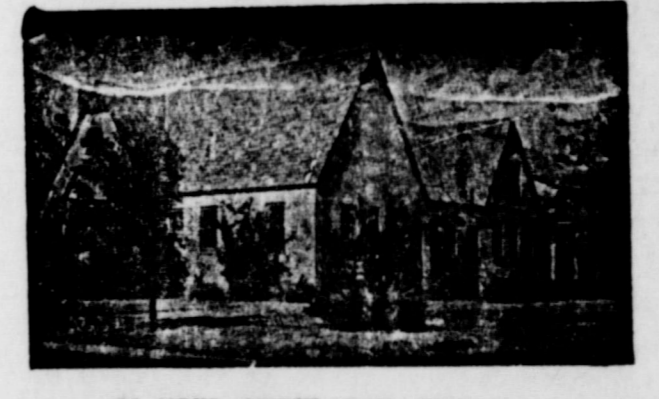
24 HOUR AMBULANCE SERVICE OXYGEN EQUIPPED — AIR CONDITIONED BRANON - PHILIPS FUNERAL HOME "DEDICATED TO HELPFULNESS" 408 N. Austin Ave., Lamesa, Texas, Telephone 7535

Moore Insurance Complete Insurance Service Phone 428-3335 O'Donnell, Tex