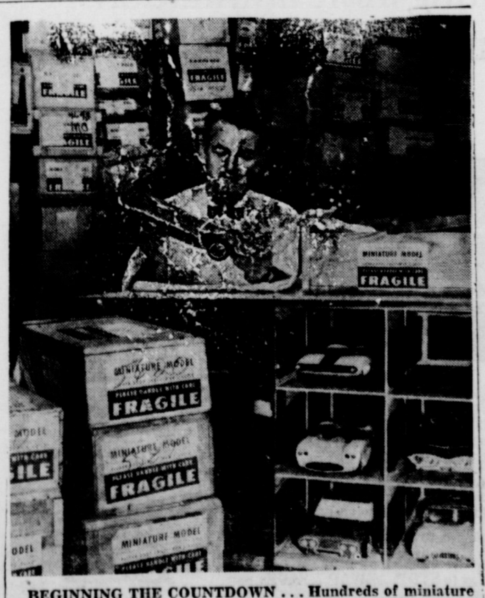
BEGINNING THE COUNTDOWN . . . Hundreds of miniature automobiles, designed and crafted by 11 through 20 year-old boys from all over the United States, await unpacking as the Fisher Body Craftsman's Guild prepares to select the winners of its 1961 model car competition. The judges' decisions will convey $117,000 in university to clarships and cash awards to these talented, teen-age des