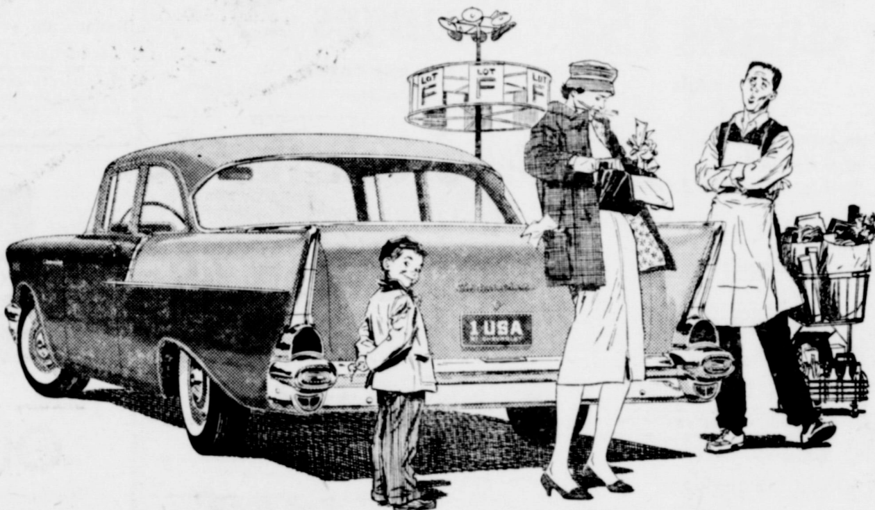
The "One-Fifty" 2-Door Sedan with Body by Fisher—one of 20 beautiful new Chevrolets for '57! AIR CONDITIONING—TEMPERATURES MADE TO ORDER—AT NEW LOW COST. LET US DEMONSTRATE!

Only franchised Chevrolet dealers display this famous trademark