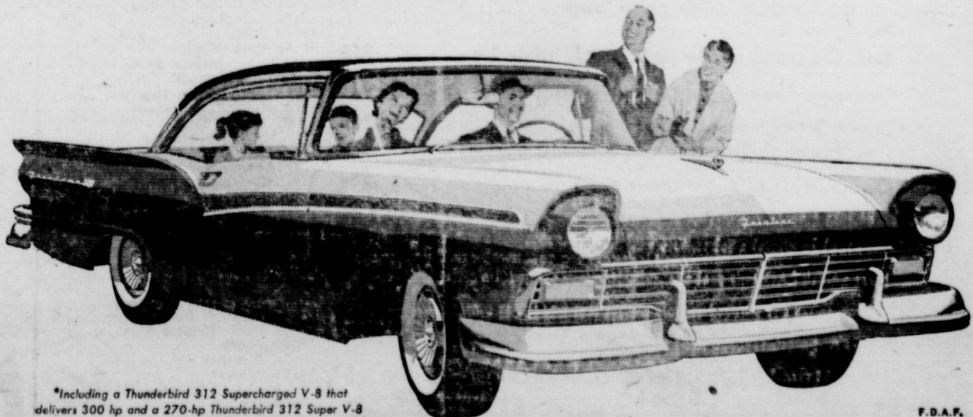
*Including a Thunderbird 312 Supercharged V-8 that delivers 300 hp and a 270-hp Thunderbird 312 Super V-8