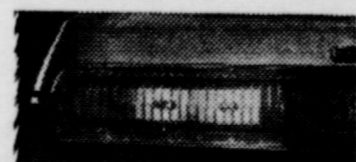
tail lights flash in 3-step sequence