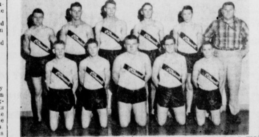
REMEMBER WHEN — back in 1952 the eagles had such a good track team under Ed Robertson? This week end the Eagle Relay team go to state meet at Austin and are favorites to win in 440 and mile relays.

Self breast examination can be taught quickly and simply to any woman during a visit to her family doctor. There is an excellent film available from the State Health Department film library on the subject, suitable for showings to women's groups.