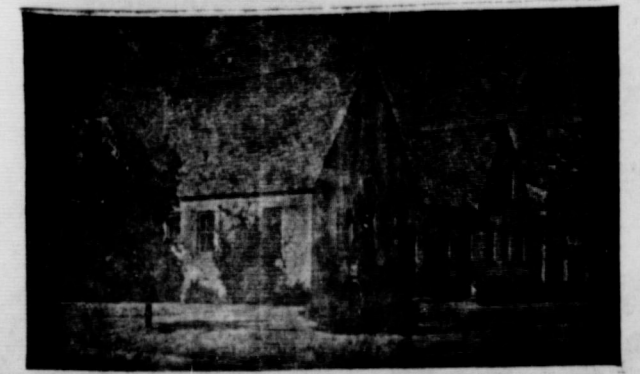
HIGGINBOTHAM FUNERAL HOME