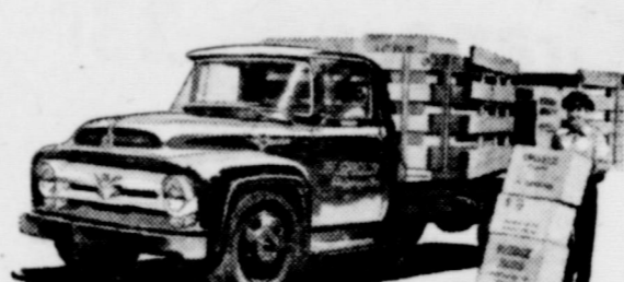
The hardest-working, biggest-saving "two-tonner" of them all is the Ford F-600. Only Ford offers a Short Stroke Six and three Short Stroke V-8's in this field. Max. GVW is 19,500 lb.