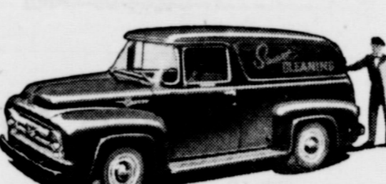
Ford's F-100 Custom panel is one of the top load carriers in its class. It provides 155.8 cu. ft. of cargo space in a smooth, fully lined interior and hauls up to 1,535 lb. of payload.