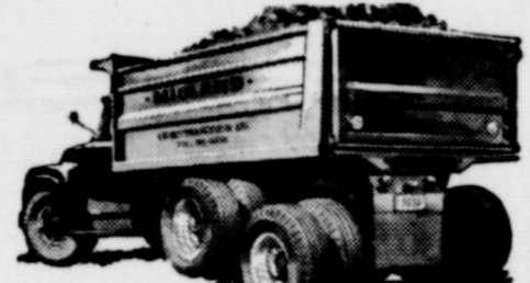
Ford tandem axle BIG JOBS are rated to carry more payload than comparable tandems of any of the leading manufacturers. T-800 model has max. GVW of 45,000 lb.—GCW is 65,000 lb.