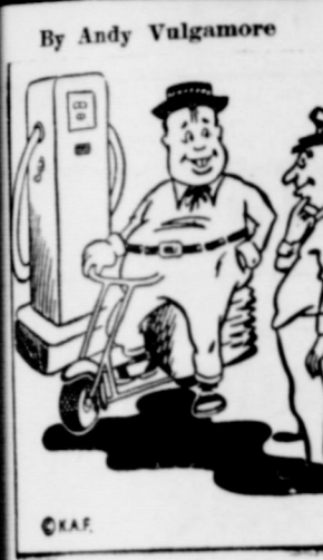
"Filter up...one pint."