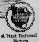
A First National Picture

To each boy under twelve years of age dressed like Jackie Coogan will be given free an admission ticket.