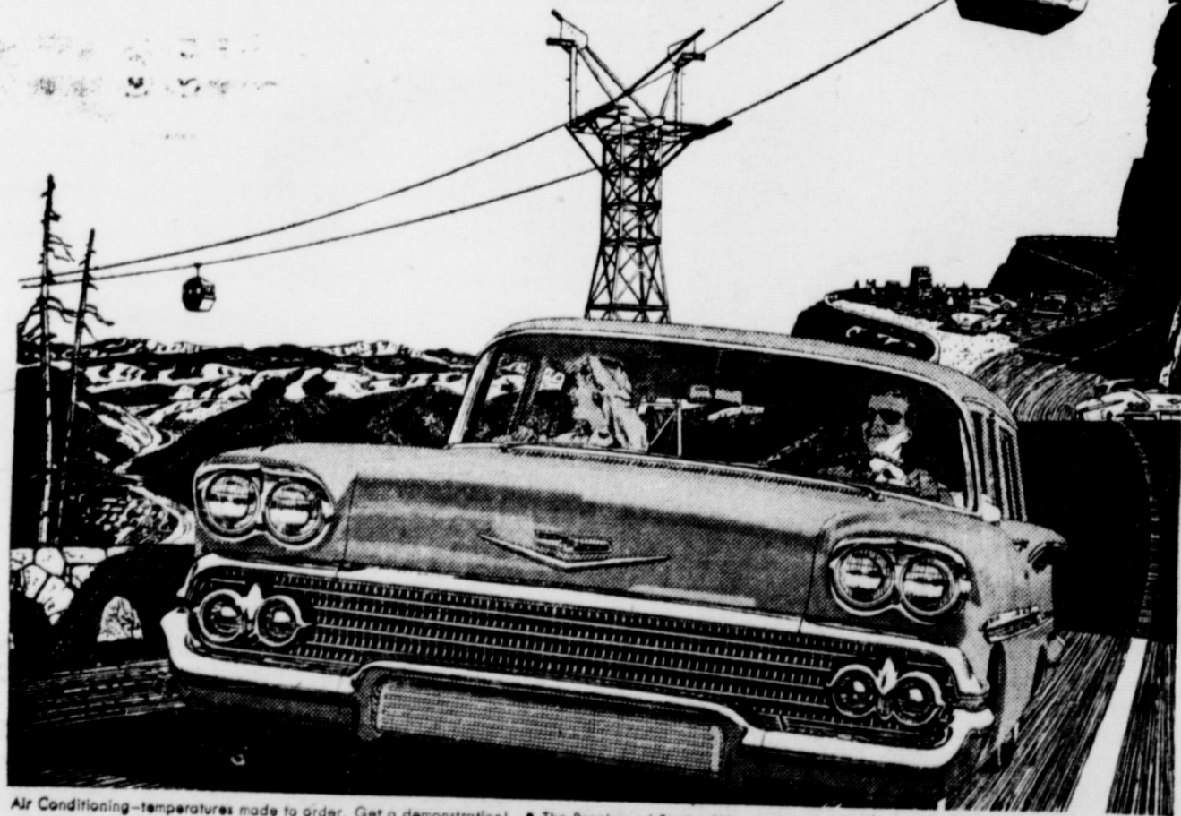
Air Conditioning—temperatures made to order. Get a demonstration! • The Brookwood Station Wagon. Every window of every Chevrolet is Safety Plate Glass.

See your local authorized Chevrolet dealer