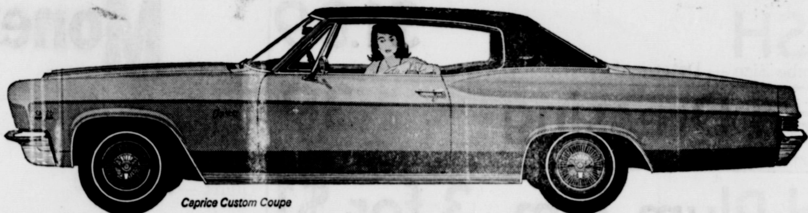
Caprice Custom Coupe