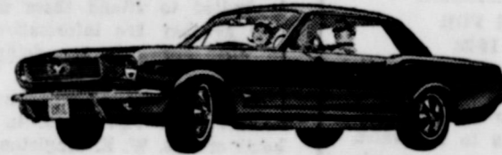
3 New Mustangs