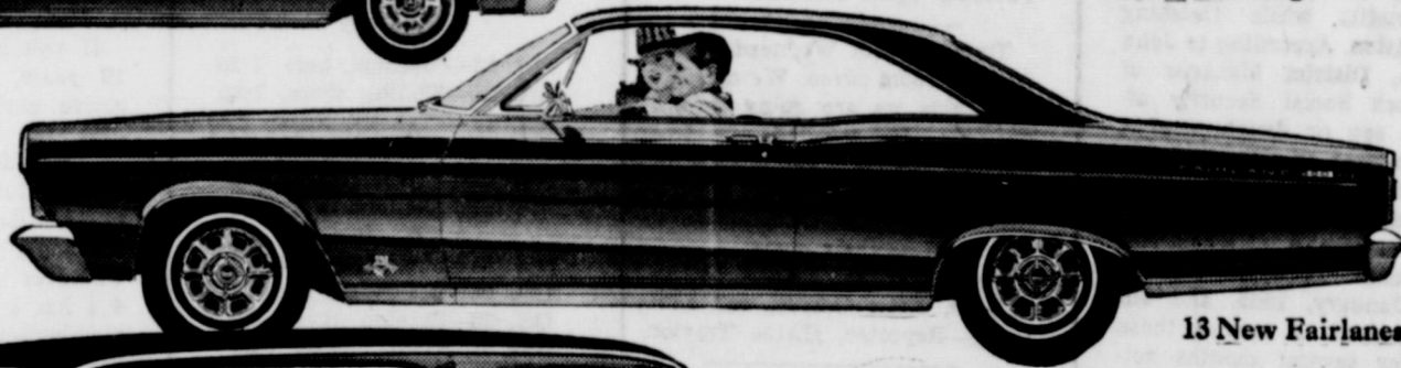
13 New Fairlans