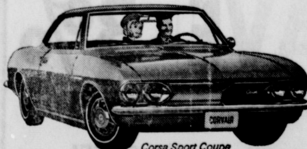
Corvair Sport Coupe