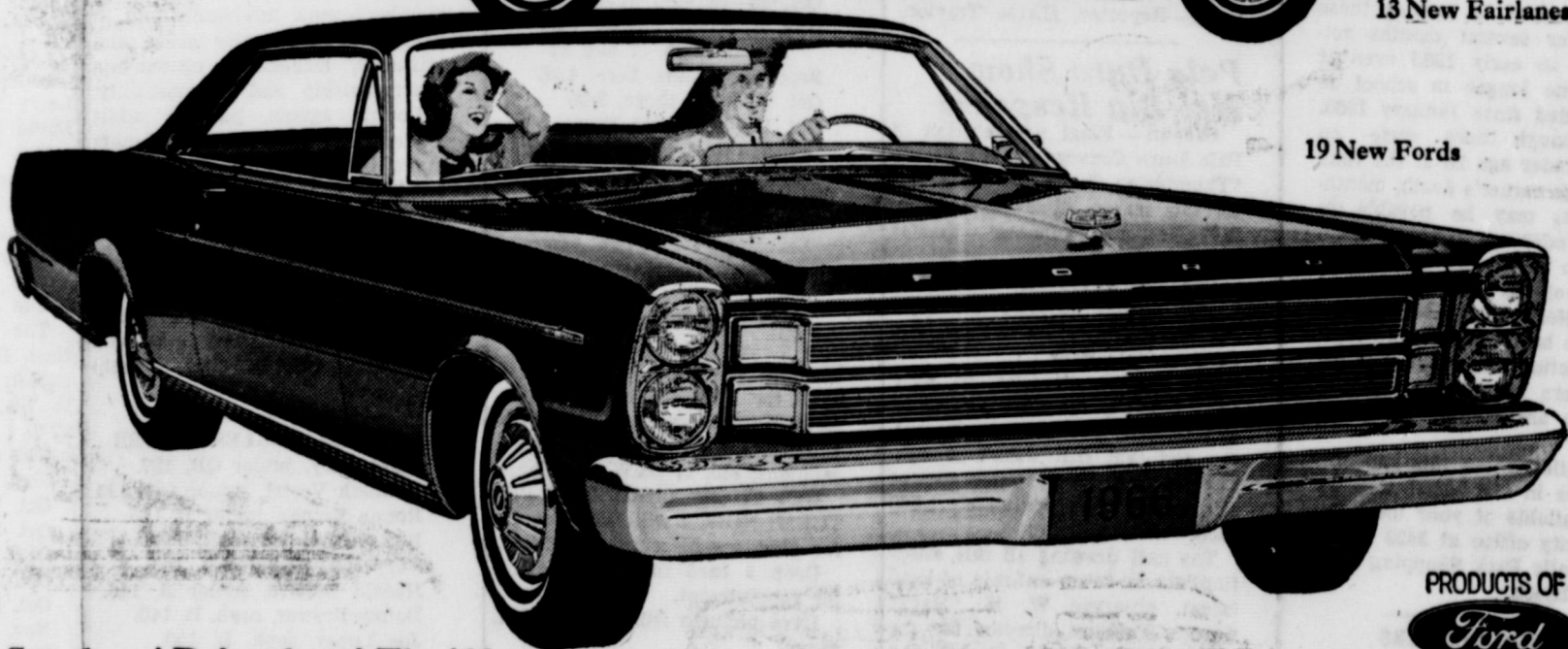
19 New Fords