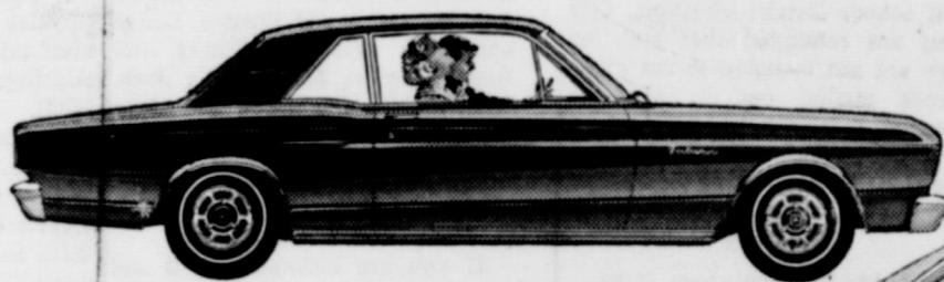
7 New Falcons

FORDS: new quiet, ultra-luxurious LTD's, new high-performance 7-Litre models with 428-cu.in.V-8. FAIRLANES: lively new XL's, GT's, convertibles. FALCONS: new flair for the economy champ. MUSTANGS: more fun-filled than ever. FEATURES: from a new stereo tape player option...to a new Magic Doorgate for wagons (swings out for people and down for cargo).