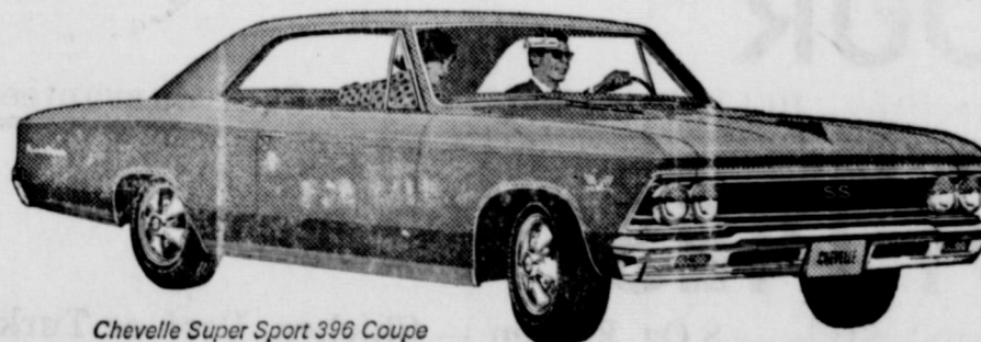
Chevelle Super Sport 396 Coupe

New 300's. New 300 Deluxe models. New Malibus. And two new Super Sport 396's—coupe and convertible—with engines that tell you exactly what kind of Chevelles they are. Both are available with 396-cu.-in. Turbo-Jet V8's, either 325 hp or 360 hp. And both come with special hood, grille, suspension, emblems, red stripe tires, floor-mounted shift. Twelve beautiful new Chevelles in all—and all as new inside as they are outside, headlamps to taillights.