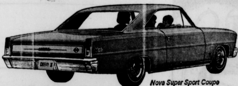
Nova Super Sport Coupe