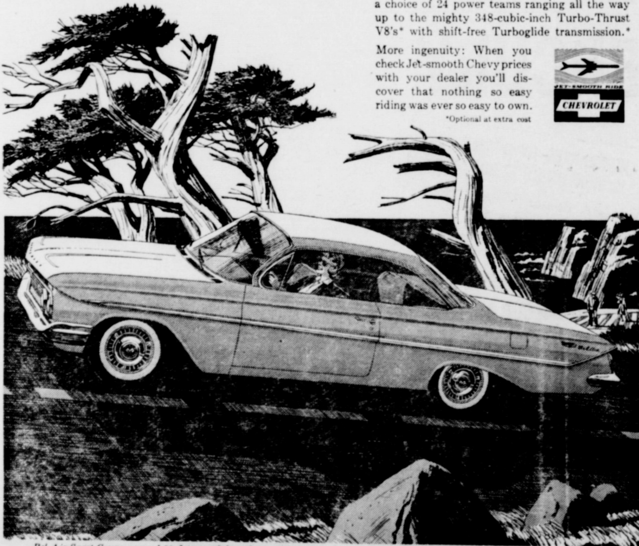
Bel Air Sport Coupe—one of 20 Jet-smooth beauties awaiting your pleasure at your Chevy dealer's

Chevy gentles rough roads with a Jet-smooth ride