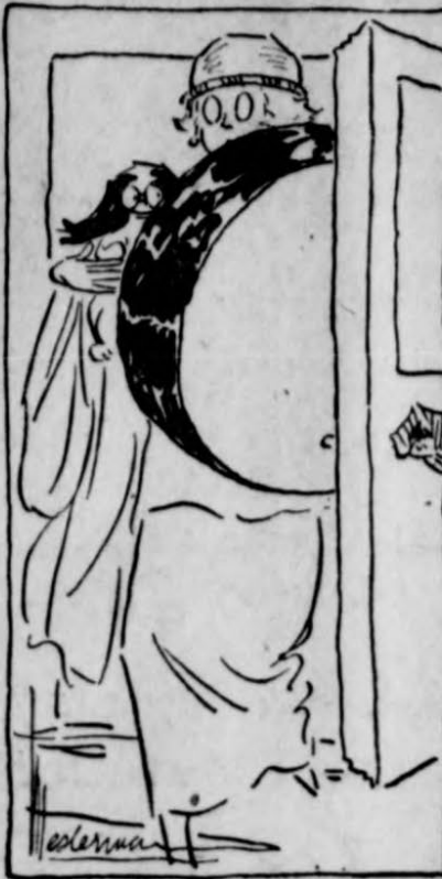
The young lady across the way says woman's gentle influence is now being felt everywhere in the business world and she sees by the paper that sentiment is ruling even in Wall Street.