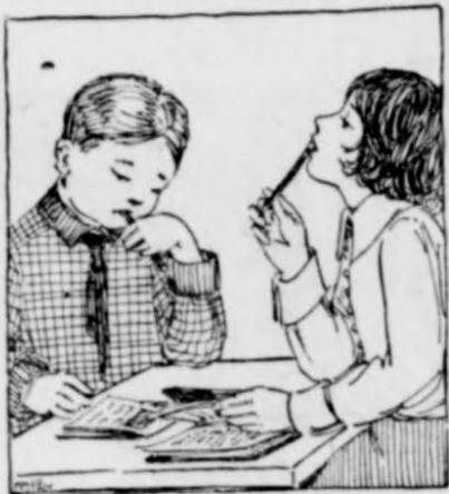
"It is Dreadful."

"I'm all at loose ends. I'm shabby and worn. Bits of me are falling off."