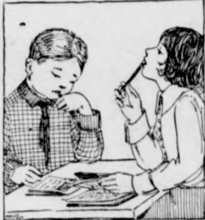
"It is Dreadful."

"I'm all at loose ends. I'm shabby and worn. Bits of me are falling off"