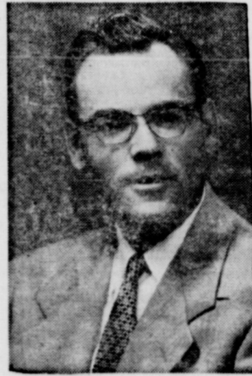
ATOMIC ENERGY AUTHORITY TO SPEAK AT ROTARY ON 27TH