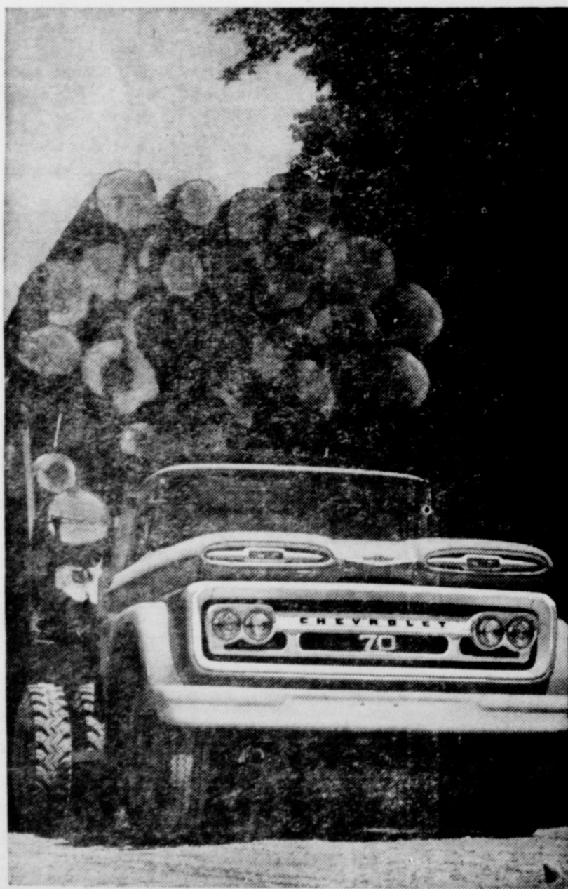
Torsion spring heavyweight