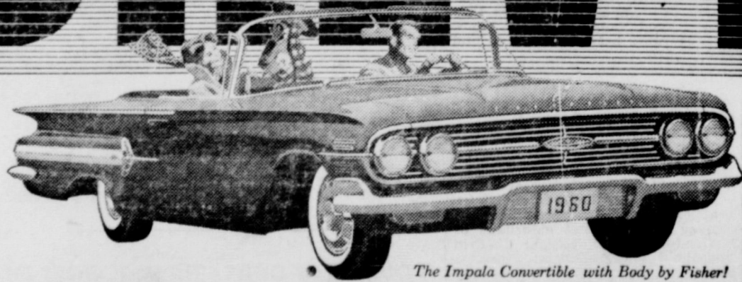
The Impala Convertible with Body by Fisher!

Why shouldn't you be driving America's first-choice car right now? You couldn't do better by your family—or your family budget—than to pick out one of Chevy's 18 FRESH-MINTED MODELS, load up its VACATION-SIZED TRUNK and take off on one of those springtime trips Chevy so dearly loves. Once you're