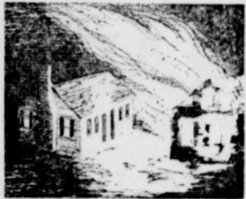
IT WAS NEXT DOOR

Your parade would not have been possible without the help of the above folks. RODEO COMMITTEE GOVERNMENT TO PAY FOR COVER CROPS HERE A practice of seeding grain sorg- hums, sweet sorghums, sudan grass, millet, barley or rye to establish a cover for control of wind erosion is expected to be set up for Lynn Co., according to Dee Green of the local ASC office. Requests for this practice are