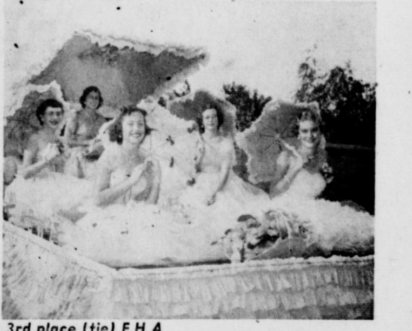
3rd place (tie) F H A

All photos for sale by W. D. Parker ( 30 different pix.)