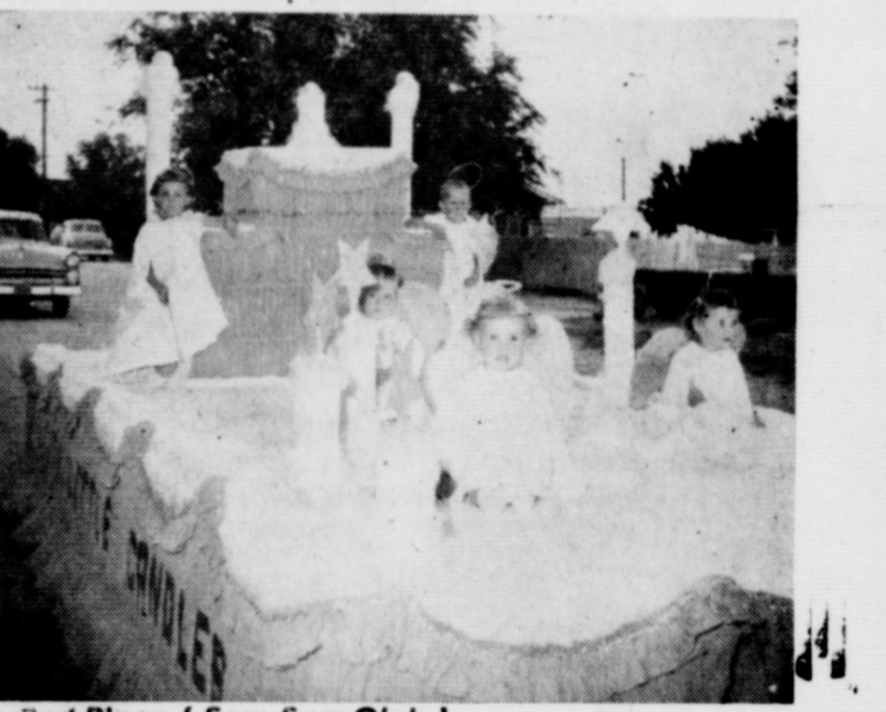
2nd Place ( Sew-Sum Club )