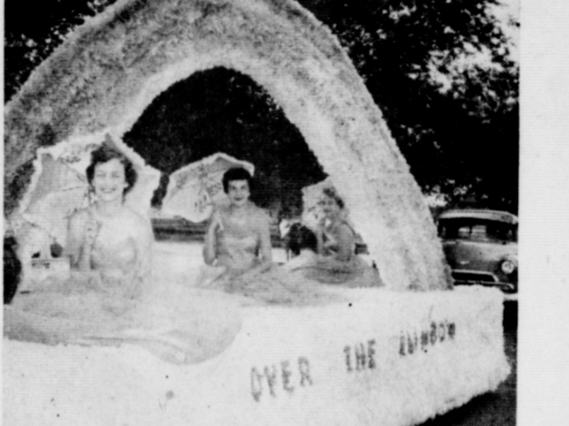
3rd (tie) Fire Department