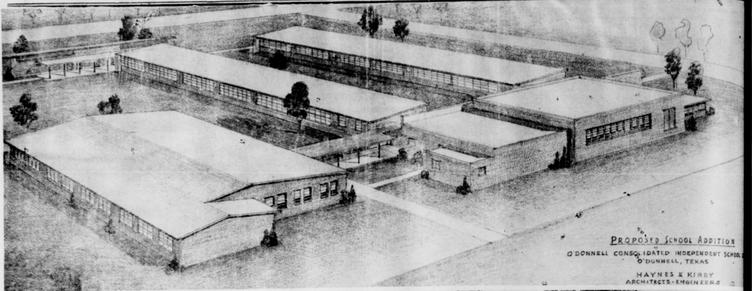
PROPOSED SCHOOL ADDITION O'DONNELL CONSOLIDATED INDEPENDENT SCHOOL O'DONNELL, TEXAS HAYNES & KIRBY ARCHITECTS-ENGINEERS