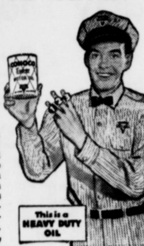
This is a HEAVY DUTY Oil

3 He'll refill with great Conoco Super Motor Oil! Conoco Super is fortified with additives that curb dangerous accumulation of dirt and contamination—protect metal surfaces from corrosive combustion acids—fight rust—OIL-PLATE against wear.