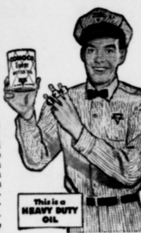
This is a HEAVY DUTY OIL

3 He'll refill with great Conoco Super Motor Oil! Conoco Super is fortified with additives that curb dangerous accumulation of dirt and contamination—protect metal surfaces from corrosive combustion acids—fight rust—OIL-PLATE against wear.