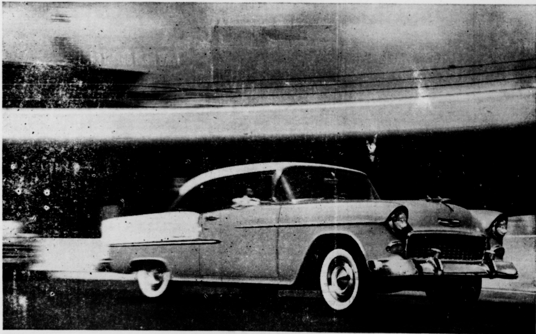
Great Features back up Chevrolet Performance: Anti-Dive Braking—Ball-Race Steering—Outfitter Rear Springs—Body by Fisher—12-Volt Electrical System—Nine Engine-Drive Choices in all models.

This is the Chevrolet that's rewriting the record books—that's making all the other low-priced cars eat its dust . . . and most of the high-priced cars, too! Be sure to try this new champ before you buy anything.