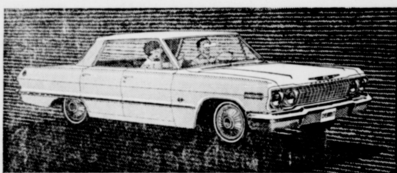
'63 CHEVROLET IMPALA SPORT SEDAN