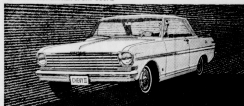
63 CHEVY II NOVA 400 SPORT COUPE