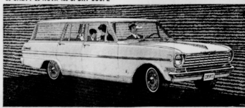
'63 CHEVY II NOVA 400 STATION WAGON