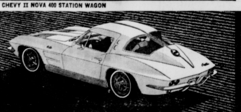
NEW CORVETTE STING RAY SPORT COUPE