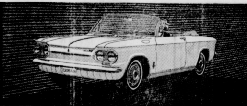
'63 CORVAIR MONZA CONVERTIBLE

It's Chevy Showtime '63! - See four entirely different kinds of cars at your Chevrolet Dealer's Showroom