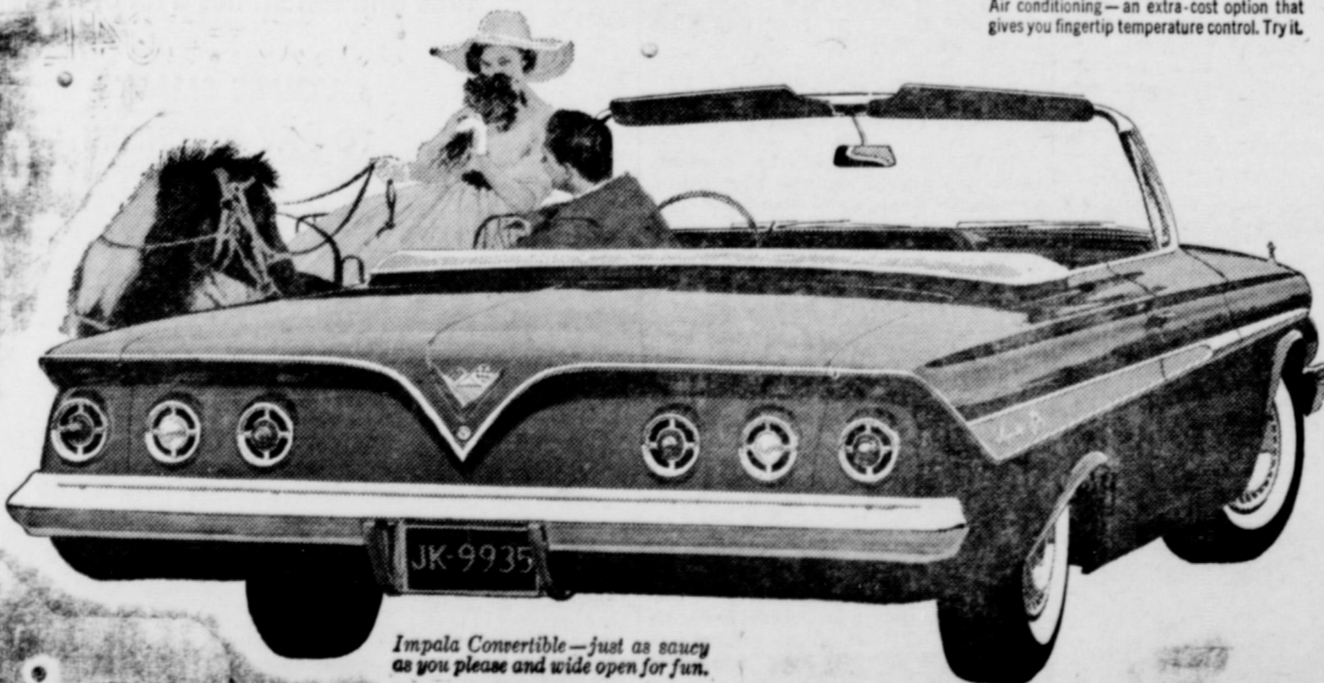
Impala Convertible — just as saucy as you please and wide open for fun.

Air conditioning — an extra-cost option that gives you fingertip temperature control. Try it.