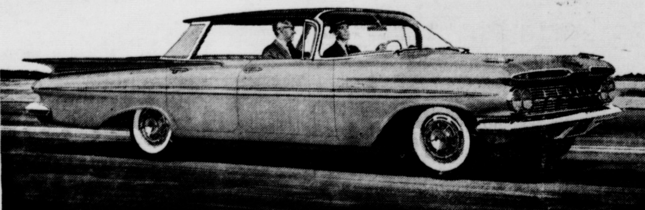
See this bright new addition to the Chevrolet line-the Bel Air 4-Door Sport Sedan

now—see the wider selection of models at your local authorized Chevrolet dealer's!