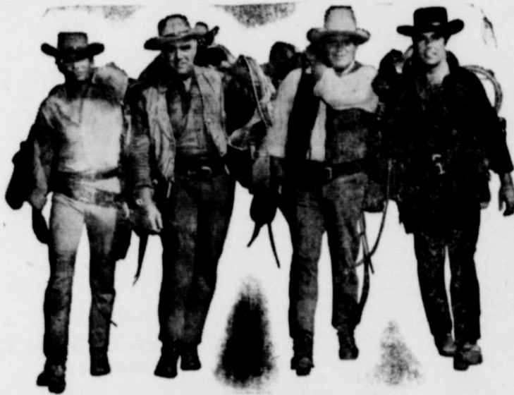
MICHAEL LANDON as "LITTLE JOE" • BORNE GREENE as "BEN CARTWRIGHT" DAN BLOCKER as "BOSS" • PERNELL ROBERTS as "ADAM"