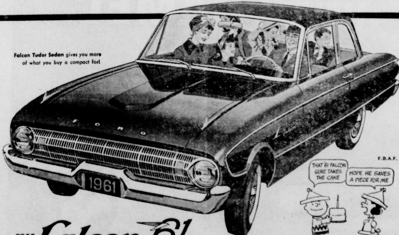
Falcon Tudor Sedan gives you more of what you buy a compact for!