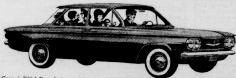
Corvair 700 4-Door Sedan (with handy fold-down rear seat)

No other car even came close to Corvair in this year's competition for Motor Trend magazine's Car-of-the-Year award. But unless you've actu- ally driven a Corvair—experienced its silken ride, light steering, grab-hold-and-go traction —you can't imagine how quick it really is to please. Your dealer's the man to see.