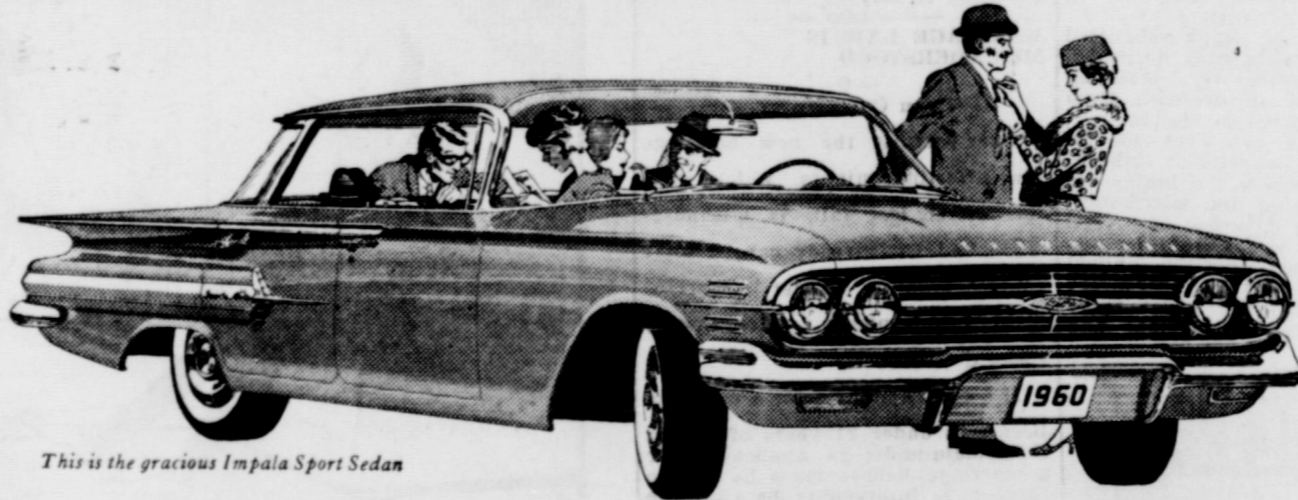
This is the gracious Impala Sport Sedan

Year's Best Seller at a Record Breaking Rate!